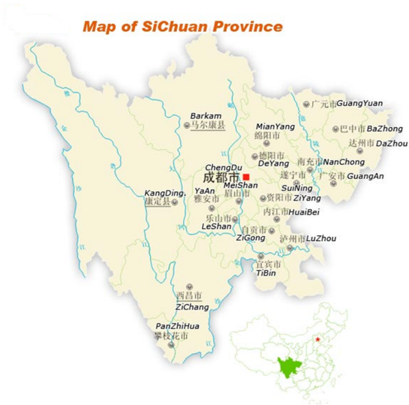
Figure 2: Casualties of Sichuan earthquake in 2008